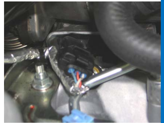
Fuel Pressure Sensor